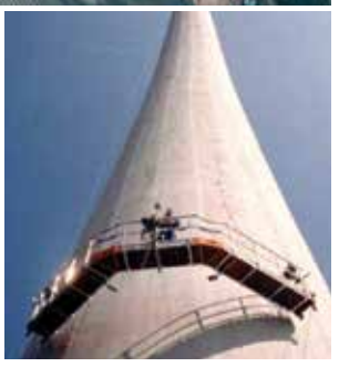
Chimney Access - E. Thomson Danemark

Whether you need access for scheduled outages, emergency repair work, or routine boiler maintenance, our marketleading access solutions help your crews maximize their productivity.