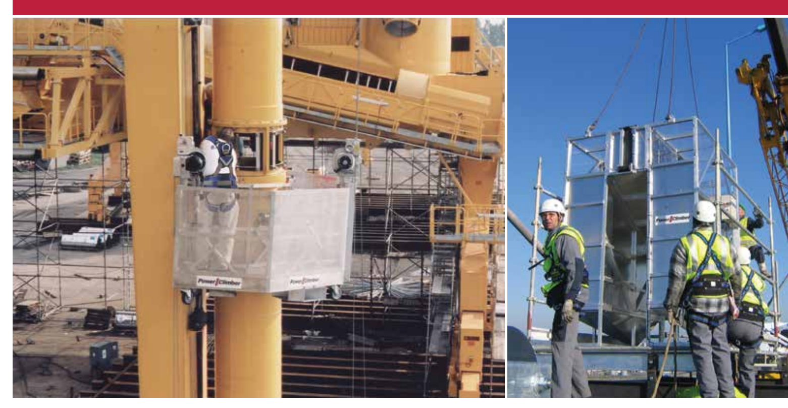
BMH Marine - Mai Liao, Taiwan